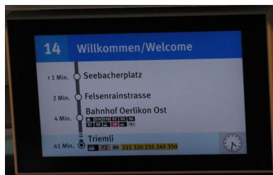
Figure 1: Route information display in a tram

In this task you will equip public transportation in Traffic with route information displays, similar to the ones real trams and buses have in Zurich (Figure 1).