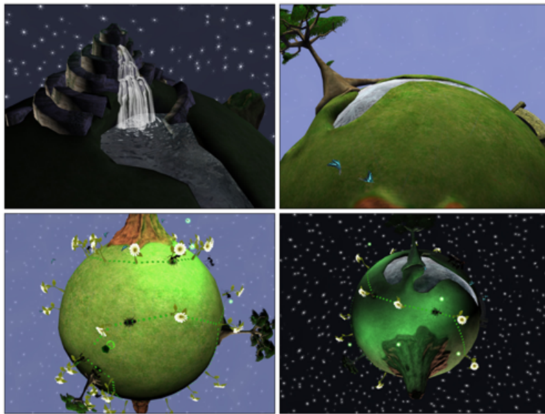
Fig. 1. Day and a night in Antworld .

EiffelMedia Recently Carter (Carter, 2006) has shown that the number one reason for boys to study Computer Science is their interest in computer games whereas for girls it was the possibility to use computers in other fields - in both cases one can argue that the visualization capabilities are of great importance. EiffelMedia (Bay, 2006b) provides visualization capabilities that are state-of-the-art and impress and motivate the students. As mentioned above, the library is maintained together with the students and is open source. EiffelMedia has a rich set of frameworks that allow building multimedia applications such as games like Antworld shown in Figure 1. The features of the library include 2D graphics, sound support, video decoding, 3D graphics, networking support, a widget toolkit and many more.